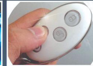
SMART KEY SYSTEM