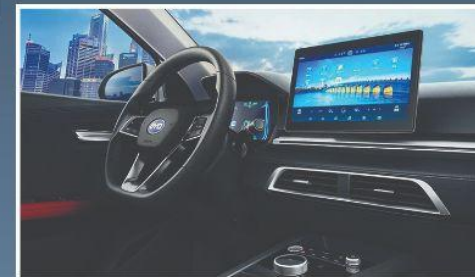
8" ANDROID MULTI-MEDIA SYSTEM