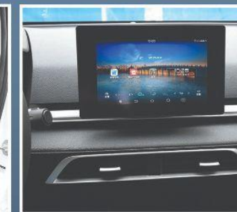
LUXURIOUS AND SPORTY EQUIPPED WITH SMART TECHNOLOGY INTERIOR