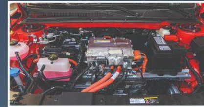
305 KM EV RANGE